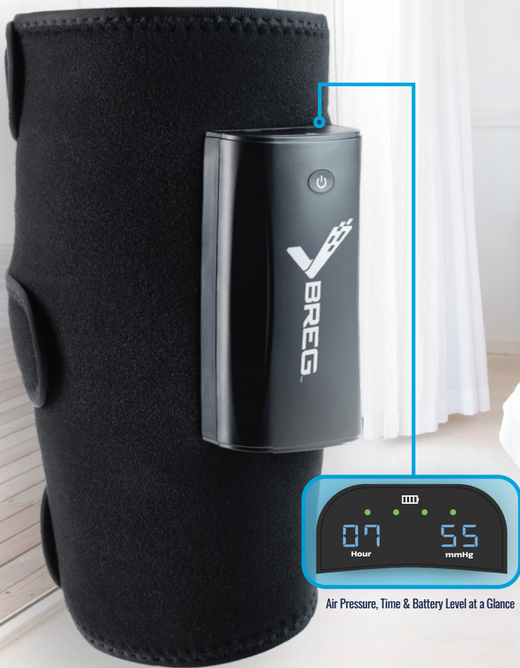
Air Pressure, Time & Battery Level at a Glance

Introducing DVT Guardian your ideal Deep Vein Thrombosis (DVT) prevention partner for a safe and comfortable recovery at home or in a clinical setting. The innovative device uses dual-chamber compression to enhance blood circulation and aid in the prevention of DVT. With preset pressure cycles that simulate muscle contractions, the DVT Guardian offers up to 20 hours of operation on a single battery charge. Its portable, rechargeable design ensures you receive consistent protection.